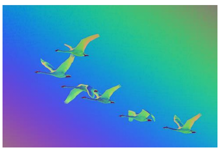
"...migration of customers to lower priced distribution models"

2 obvious examples include the dominance of Amazon on retail and the demise of travel agents (Covid just nailed the coffin shut on the last travel agent in our area). Customers are adapting to new self-serve technology and want better shopping experiences and above all better prices .